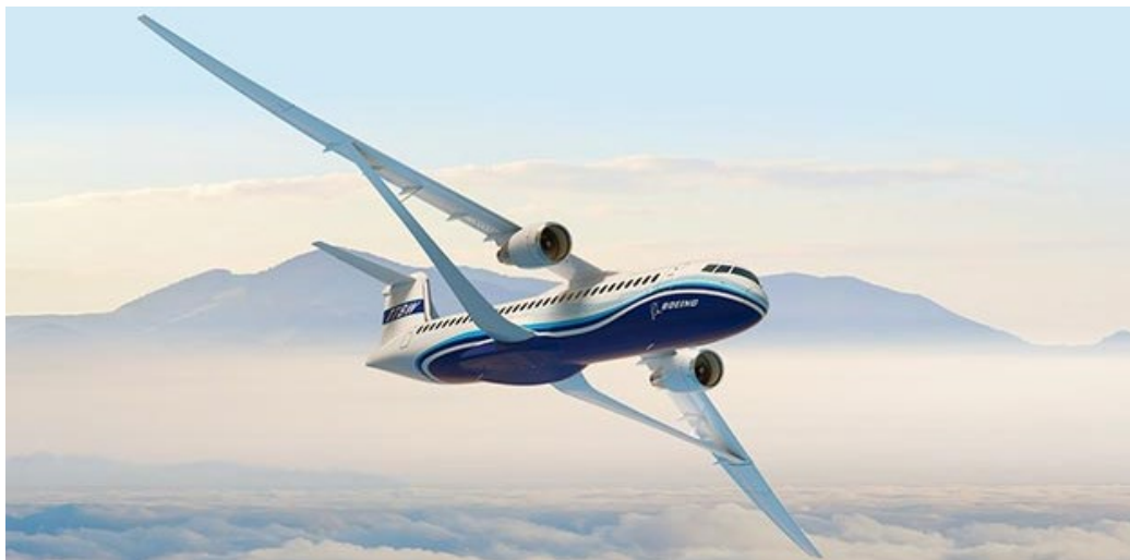
Boeing X-66A (Boeing 2019)